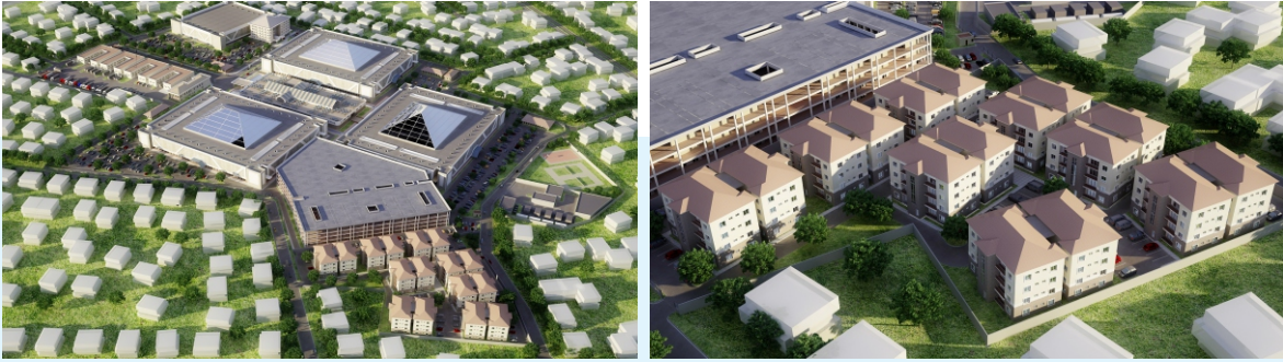
The Proposed Lagos ICT Park Katangowa, Lagos.