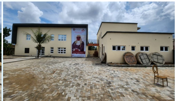
The Youth Center and Museum Asaba, Delta State for Punuka Foundation