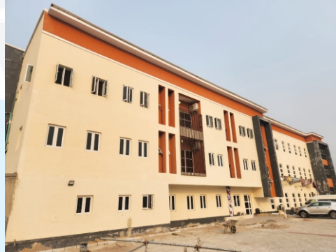
The Child care Center for Punuka Foundation, Sangotedo, Lagos